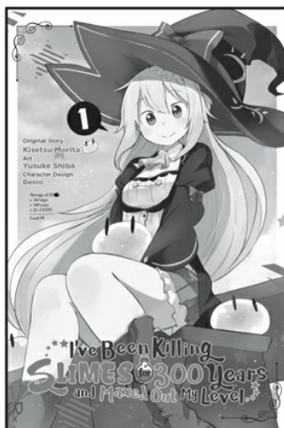
Manga Volumes 1-4

SLIME TAOSHITE SANBYAKUNEN, SHIRANAIUCHINI LEVEL MAX NI NATTEMASHITA © 2017 Kisetsu Morita © 2017 Benio / SB Creative Corp.