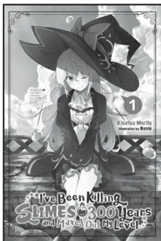
Light Novel Volumes 1-9